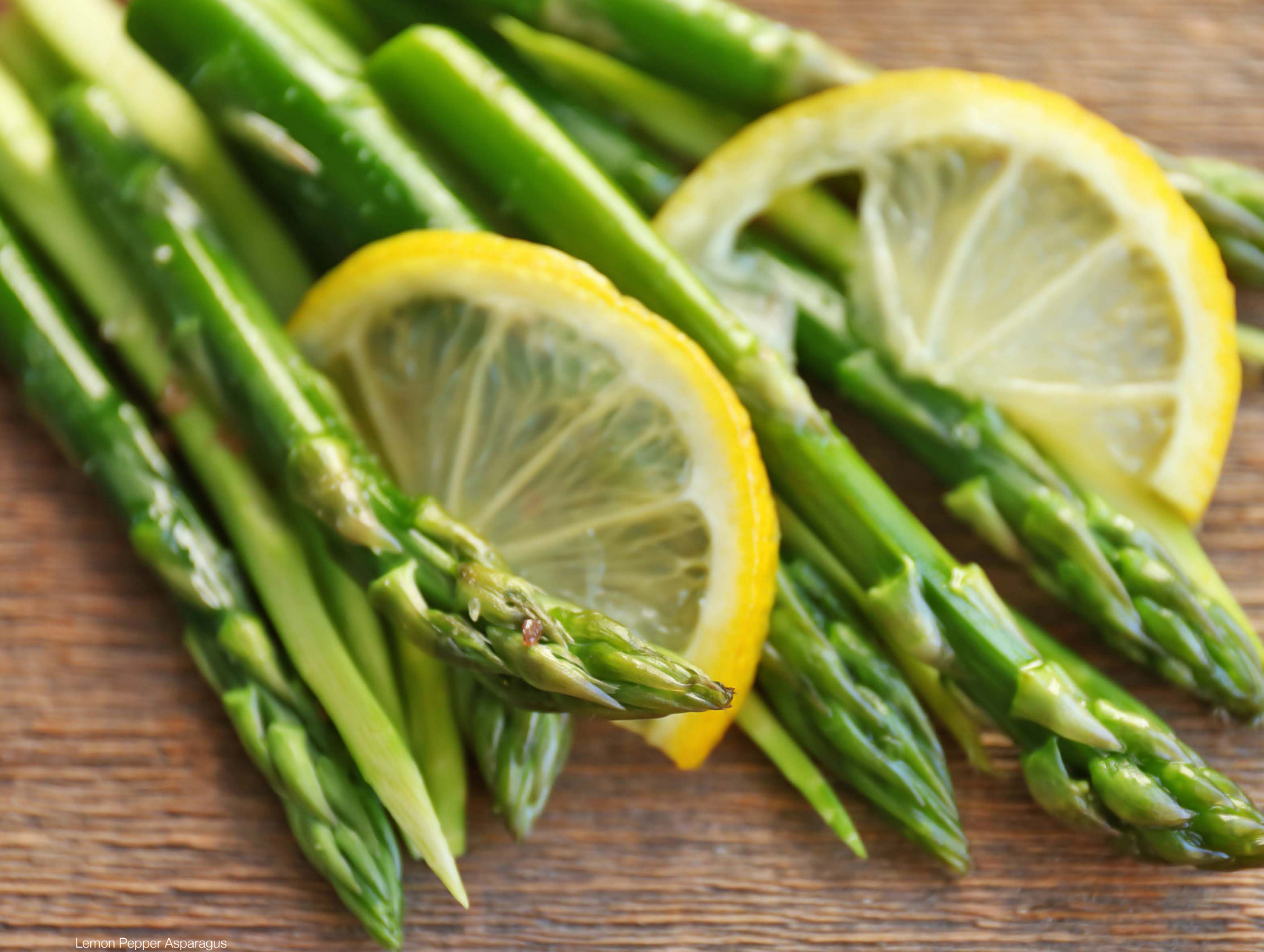
Lemon Pepper Asparagus