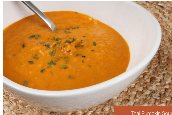
Thai Pumpkin Soup

Sauté onion in olive oil until soft. Add tomato paste, pumpkin, ginger, garlic, and broth. Combine until thoroughly heated and place in blender. Add chilies, coconut cream, coconut milk, and lemon juice. Blend for 30 seconds. Season with sea salt and pepper to taste. Serve immediately. Note: If a less sweet soup is desired, omit coconut cream and increase coconut milk to 1½ cups. Serves 2-4.