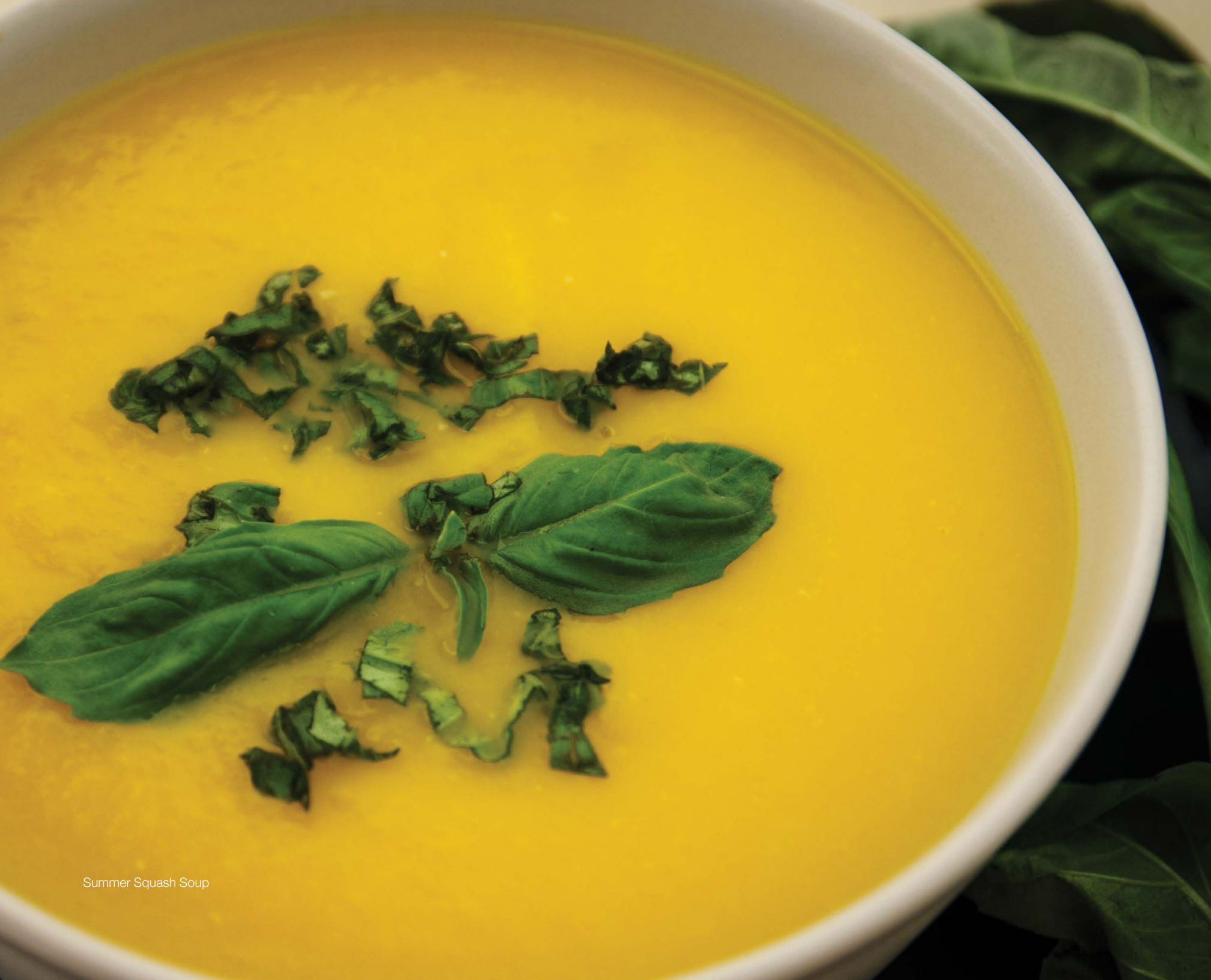
Summer Squash Soup