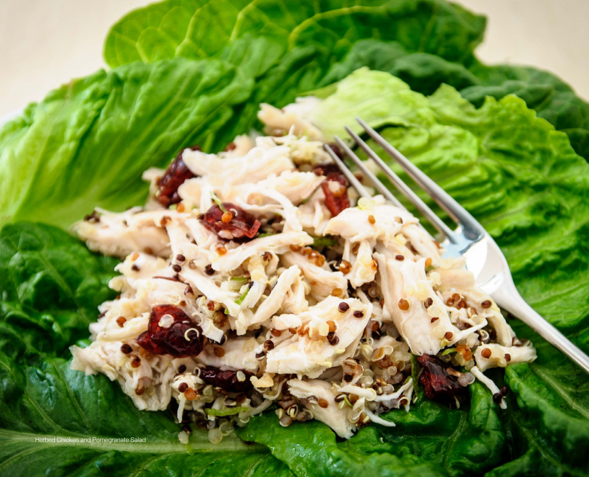
Herbed Chicken and Pomegranate Salad