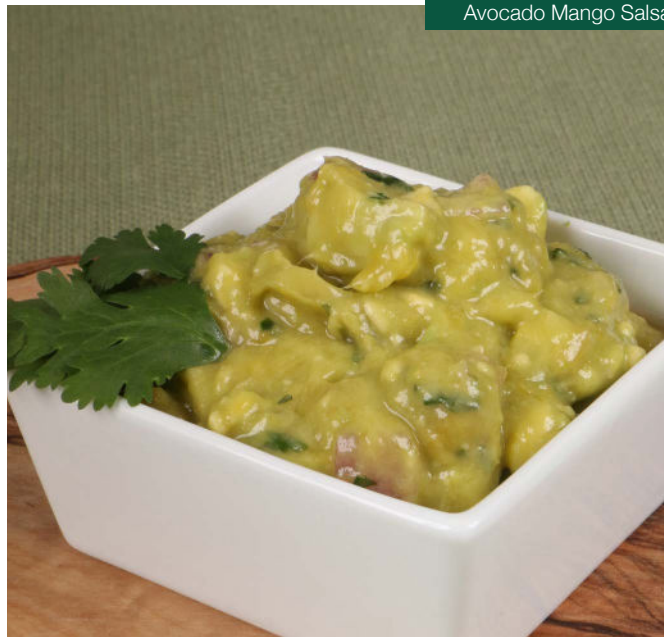
Avocado Mango Salsa

Place all ingredients into blender and blend for 10-20 seconds or until desired consistency. Serve chilled. Serves 4.