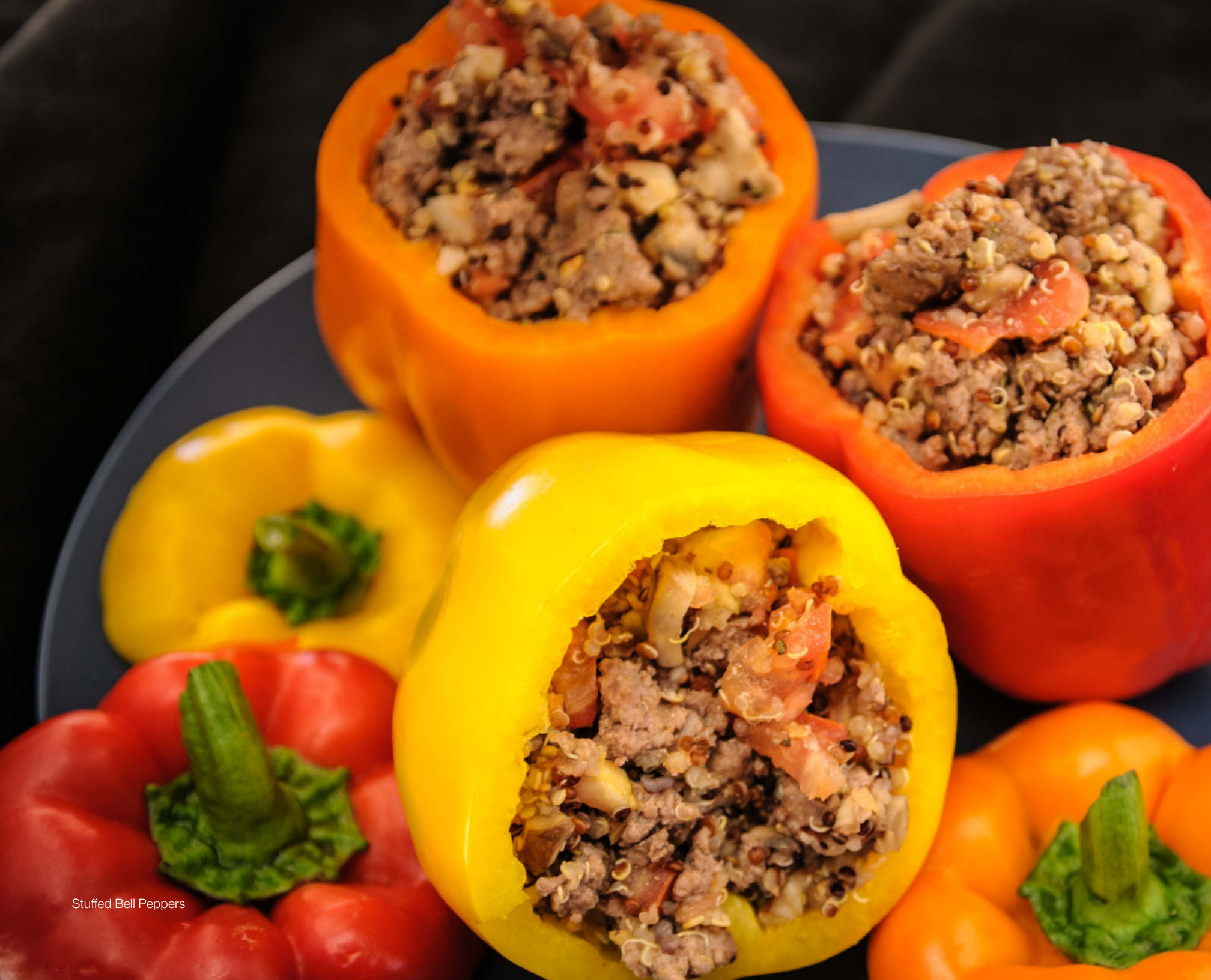
Stuffed Bell Peppers