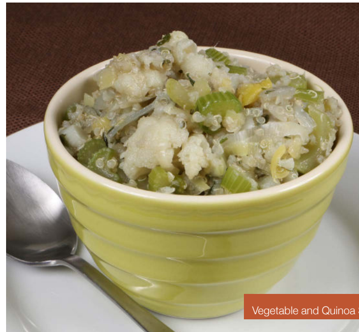
Vegetable and Quinoa Soup

Preheat oven to 350 F. Rub potatoes with 1 tablespoon olive oil and place on baking sheet. Wrap a head of garlic in aluminum foil and place on baking sheet with potatoes. Bake for 30 minutes or until potatoes are soft. Heat remaining oil in a medium sauté pan with the onion until onion is translucent, about 3 minutes. In a blender or food processor, add onion, garlic, and about half of the potatoes. Purée mix thoroughly. Transfer to a large soup pan and add all remaining ingredients. Heat to a boil, then lower heat and allow to simmer for about 15 minutes. Serves 4.